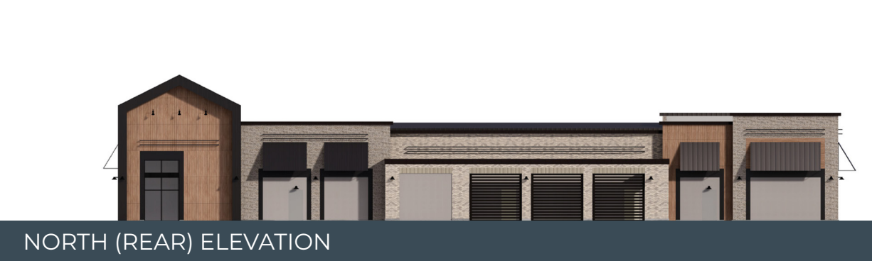
NORTH (REAR) ELEVATION