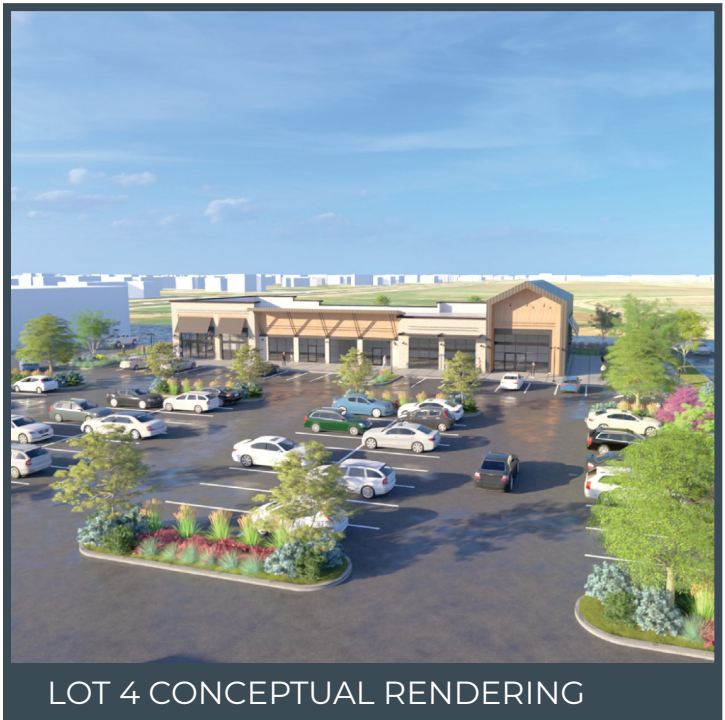
LOT 4 CONCEPTUAL RENDERING