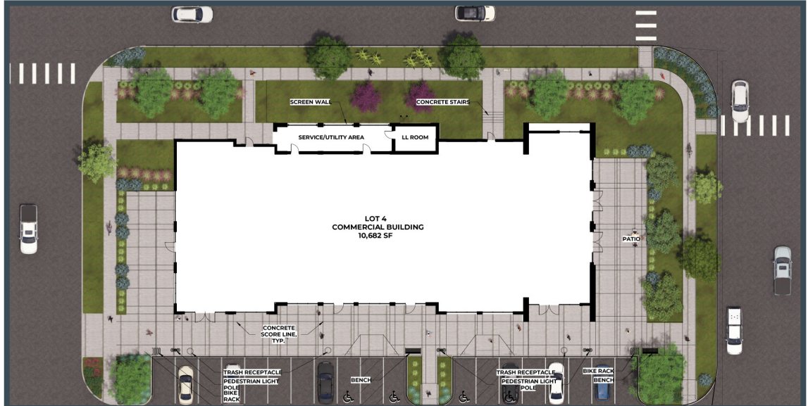
FLOOR PLAN LOT 4