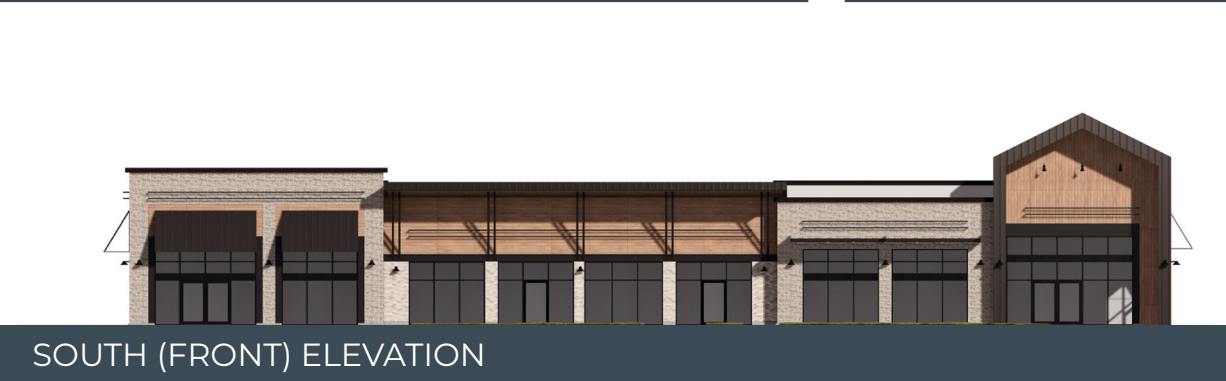
SOUTH (FRONT) ELEVATION